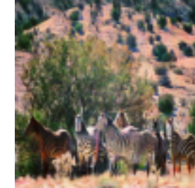
P_{0.5}(w) \rightarrow Q_{12}(w, f)