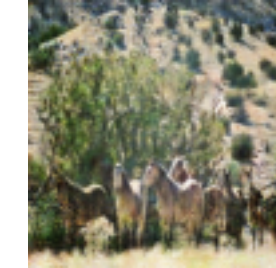
Q_{12}(w, f) \rightarrow P_{0.5}(w, f)