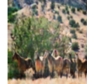
P_{0.5}(w, f) \rightarrow Q_{12}(w, f)